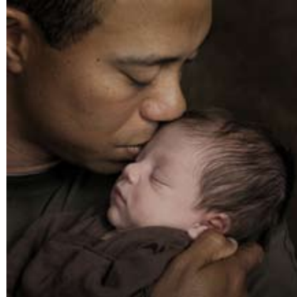
Tiger Woods with son Charlie.